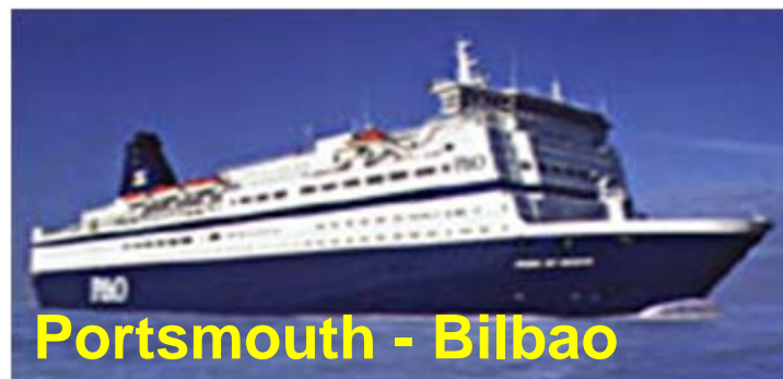
Portsmouth - Bilbao