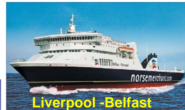
Liverpool - Belfast