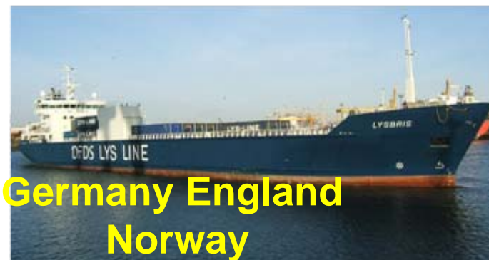
Germany England Norway